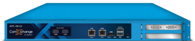
ComXchange CIP-760-CX 750 or Fewer Total Extensions