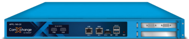
ComXchange CIP-740-CX 150 or Fewer Extensions

141P's ComXchange Controllers are powerful 1U appliances, available in five base configurations designed to suit the size and needs of various hospitality properties.