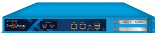
ComXchange CIP-750-CX 500 or Fewer Total Extensions