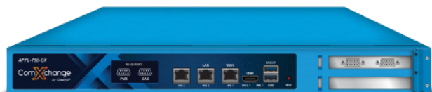
ComXchange CIP-790-CX 1500 or Fewer Total Extensions