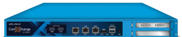
ComXchange CIP-795-CX 3000 or Fewer Total Extensions